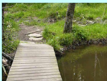
A boardwalk along the Price Lake Loop Trail