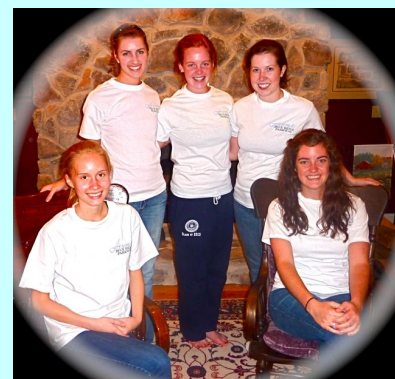
Notre Dame students volunteering with the Fisher Peak Chapter.