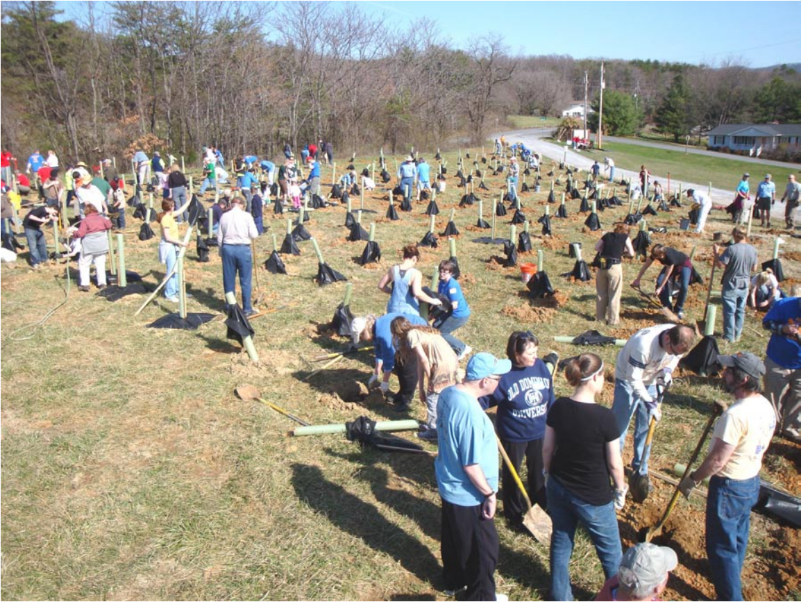
Roanoke, VA – Nearly 150 adult and youth volunteers turned out to support the Blue Ridge Parkway March 20. Five hundred hardwood and pine seedlings were planted near mile marker 104 to shield the view of the urban sprawl cropping up on the Parkway near Roanoke.