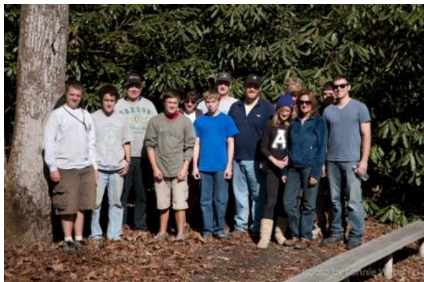
The Price Lake Trail restoration team takes a break from their work for a photo.