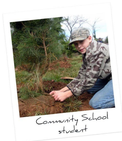
Community School student