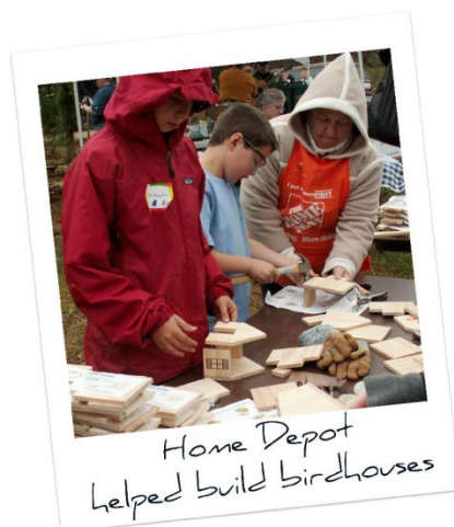
Home Depot helped build birdhouses

Two representatives from Home Depot were also on hand to assist the children in building birdhouses or leaf presses, which they took home with them.